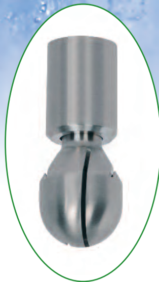
Surface finish ideal for sanitary applications