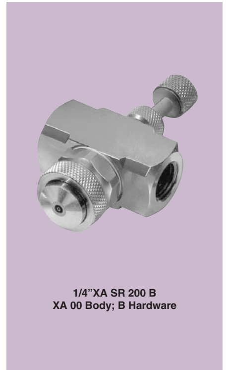
1/4" XASR 200 B XA 00 Body; B Hardware