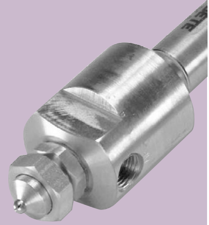
1/4"XA02 SF 050 F XA 02 Body; F Hardware