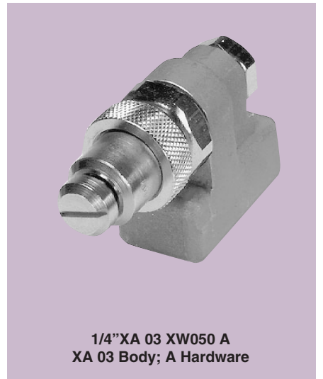
1/4" XA 03 XW050 A XA 03 Body; A Hardware