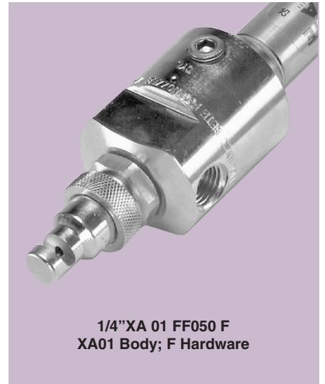
1/4" XA 01 FF050 F XA01 Body; F Hardware