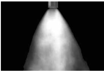
70° Hollow Cone