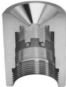
Cutaway view of carrier showing lugs and BETE's unique locking design