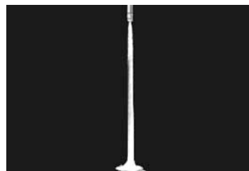
0° Straight Jet

Cleaning, Degreasing, Cleaning Wires and Felts—Pulp and Paper